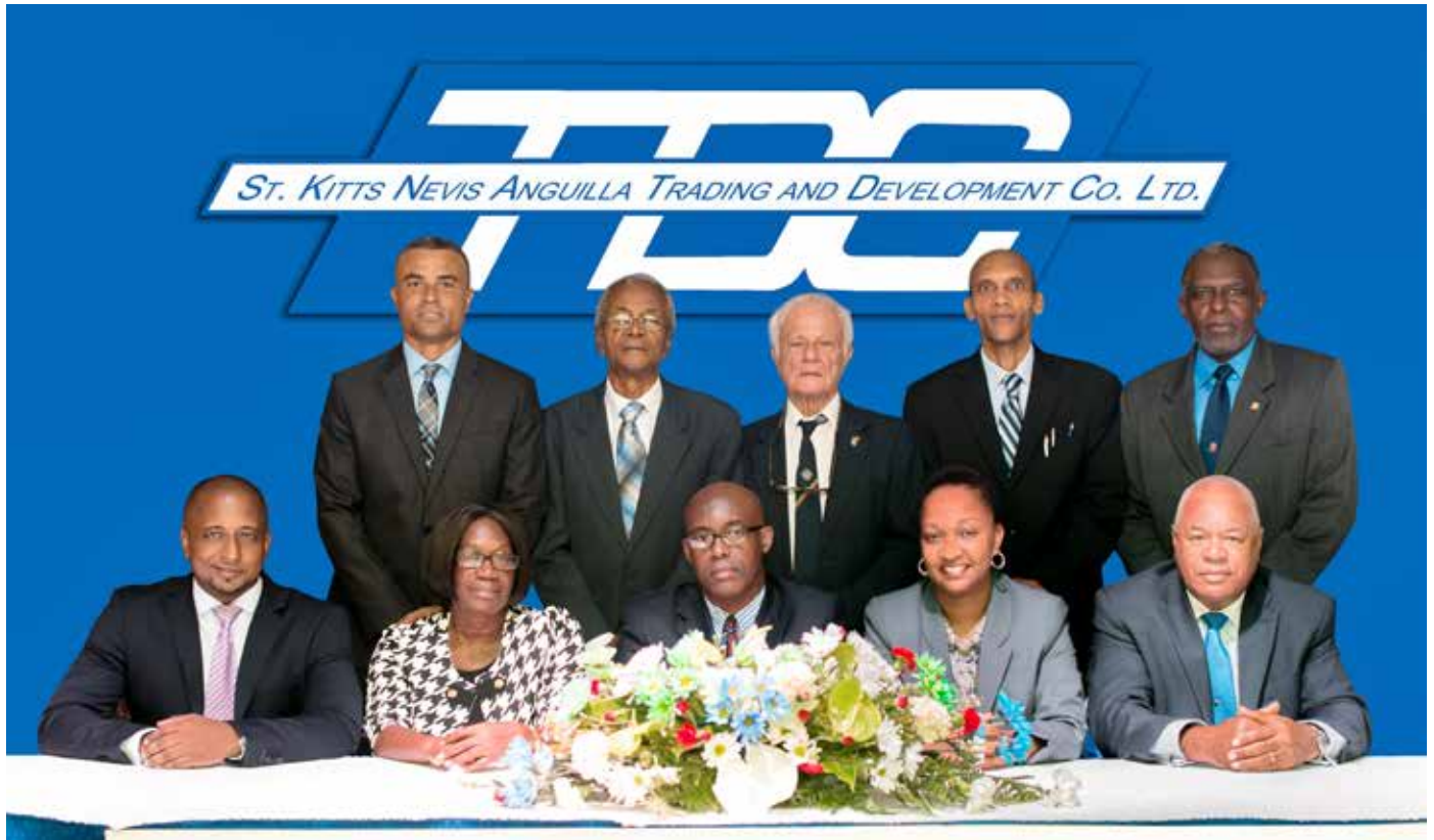
(Photograph taken at the 2014 Annual General Meeting)